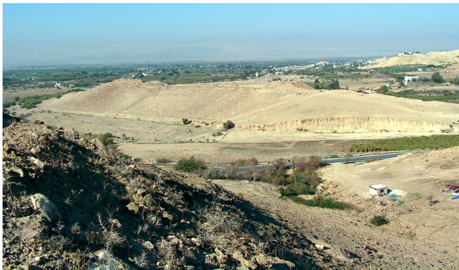
Tall El Hammam (Sodom) Excavation

Below are two pictures of the Tall El Hammam archaeological excavation site.