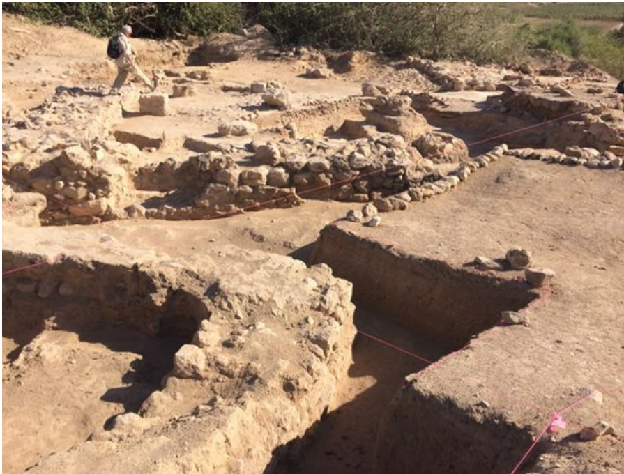
Tall el-Hammam Gateway Area

The defenses at Sodom were formidable, and for 900 years or more it was a place of continuous occupation. Unlike other cities of its day that saw periods of destruction and abandonment, Sodom stands out as a large, strongly-defended, city that had passed the test of time. Except for the one incident where the city's population was taken prisoner by Chedorlaomer and his allied kings (ultimately rescued by Abraham and returned to its previous state), its citizens have had nothing to fear regarding their enemies. This will be covered more in our next lesson.