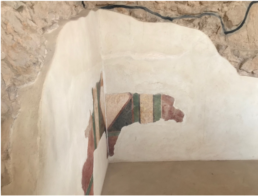
Plaster and Painted Walls at Masada