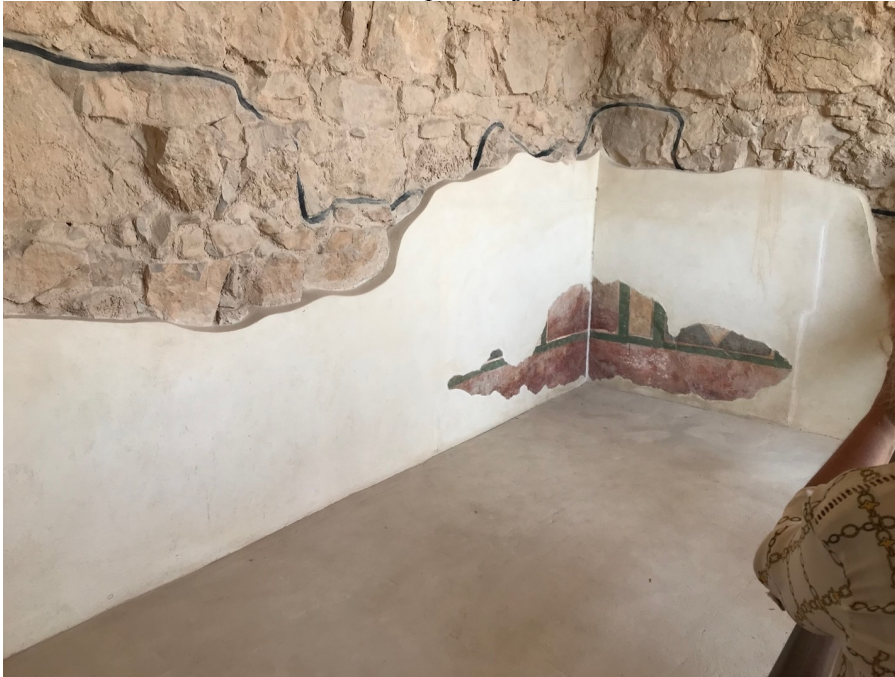
More Plaster and Painted Walls at Masada