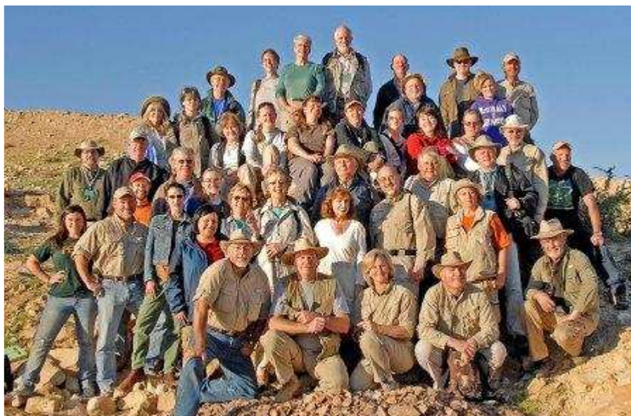
TeHEP FIELD TEAM PART TWO - 2010

Hopefully, tomorrow will be a little cooler. At least that's what the weather report says. But we've got no complaints, especially seeing all the cold weather across the USA and also in Europe.