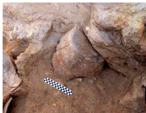
LARGE EBA STORAGE JAR UNDER RUBBLE