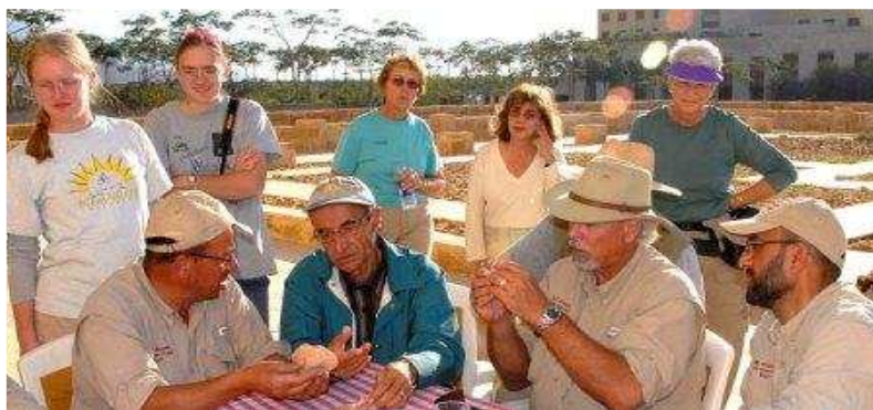
TeHEP POTTERY READING TEAM

rose to near 90 degrees (F) and the finds were coming fast and furious. The pottery we're getting this season is pretty amazing. At the levels we're presently working most of it is EB3, IBA, and MBA. This pretty much covers the Sodom gamut from Gen 10 through 19.