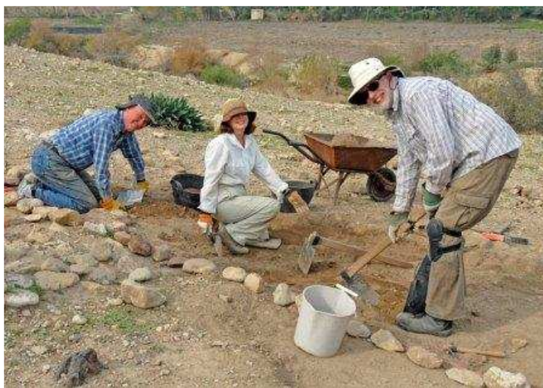
OPENING UP A NEW PROBE ON THE NW SIDE OF LOWER HAMMAM

Excavation through the EB3 gateway is now exposing a cobble-and-plaster street or plaza that dates to phase earlier than the gateway itself. We've also got some mudbrick coming up outside the city walls that is very interesting, and entirely unexpected. We don't know what it is yet, but I think we'll probably have a theory by tomorrow.