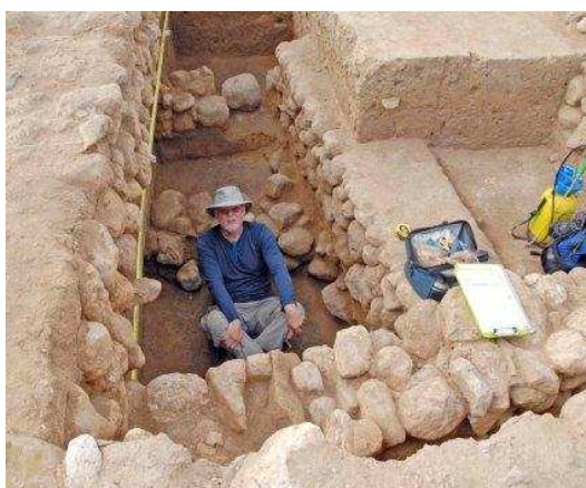
HAL'S SQUARE IN THE BANANA PALACE