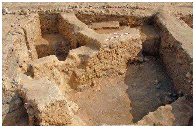
BRONZE AGE HOUSE WALLS

We've now confirmed that Tall el-Hammam/Sodom is at least as old as we originally thought. Welcome to the Chalcolithic Period! We now have confirmed Chalcolithic occupation on the southern end of our LA.28 trench, outside the area encircled by the massive EBA fortification walls. This means that the city was continuously occupied for nearly 3,000 years before it was destroyed toward the end of the MBA (time of Abraham). This is a very exciting development, to say the least.