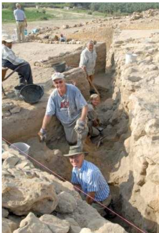
CLEARING IN FRONT OF THE EBA CITY WALL