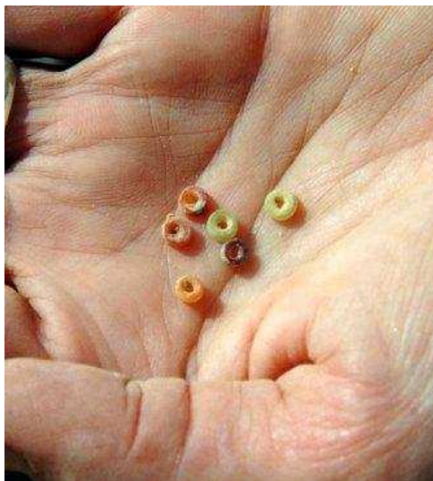
5000-YEAR-OLD BEADS FROM SCREENING

Talk to you tomorrow. Thanks for your continued and much needed financial support. I know I say that a lot, but I truly mean it. You never cease to amaze me.