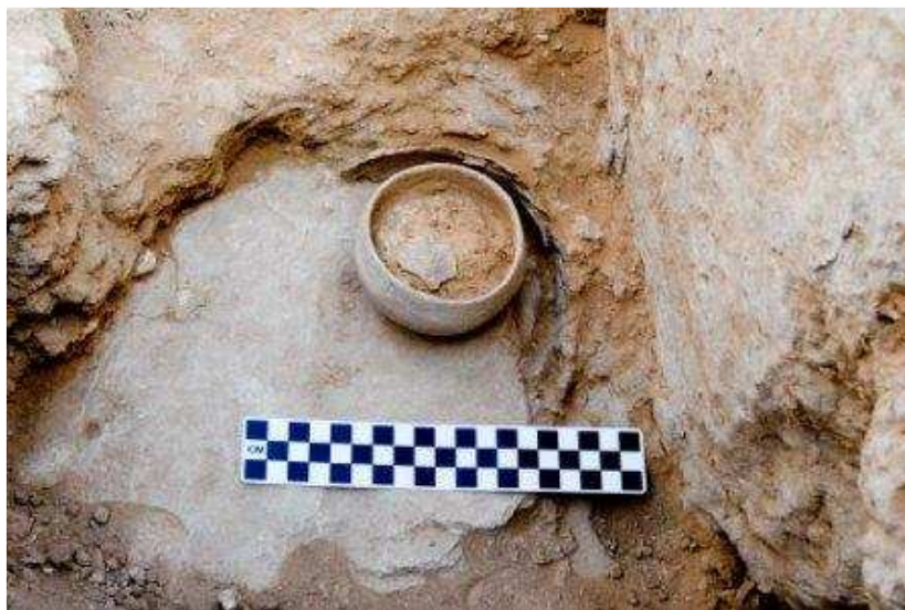
EB1 BOWL IN SITU WITH COVERING BOWL STILL VISIBLE