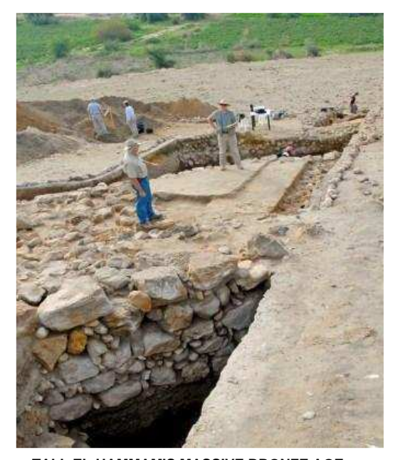
TALL EL-HAMMAM'S MASSIVE BRONZE AGE FORTIFICATIONS

We normally take off on Saturday, but we've got a very limited number of days left at the site, and we wanted to take advantage of the beautiful weather.