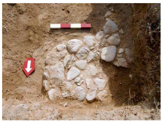
FLOOR WITH A SPECIAL FUNCTION, BUT WHAT?

I think many of our remaining team members are starting to get a bit weary, but everybody's hanging in there for the final, intensive week of work and wrap-up. I feel overwhelmed when I think about how much we've got to do before we leave, but I'm trying hard just to focus on one thing at a time. I think everyone else is doing the same thing.