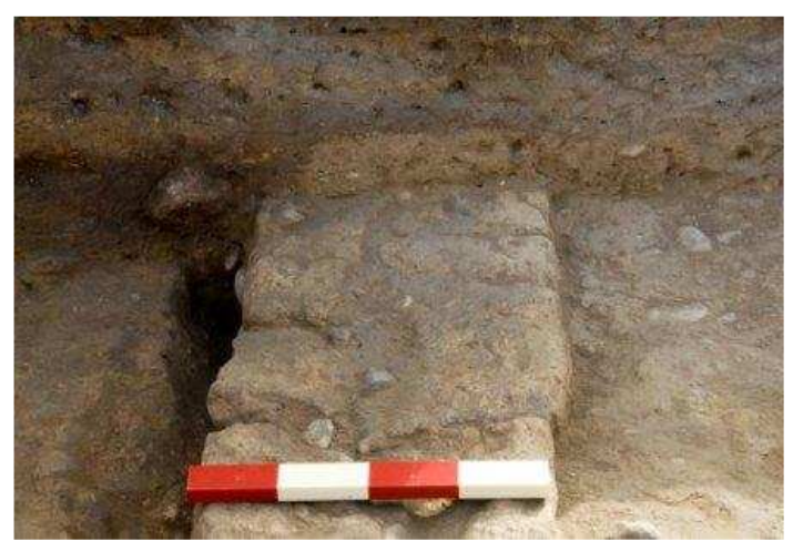
CHALCOLITHIC MUDBRICK WALL