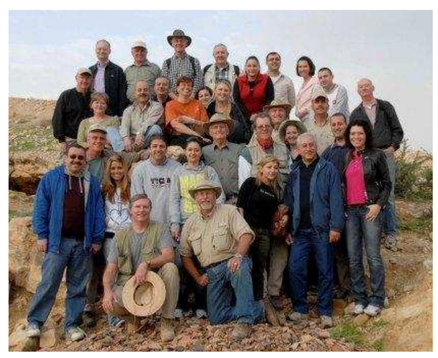
THE MOVENPICK MANAGERS WITH THE TEHEP TEAM

I'm ever grateful for the donations that are still coming. We need these! God bless you all.