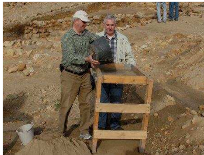
MOVENPICK MANAGERS HAULING GUFFAHS