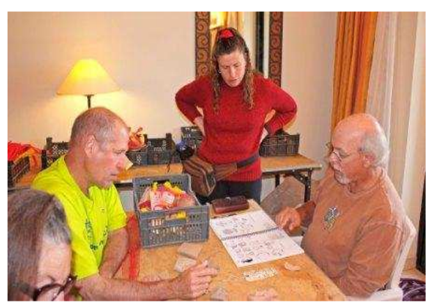
COMPARING PUBLISHED POTTERY WITH OURS