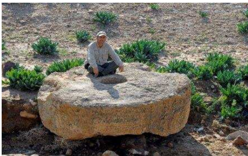
GIANT MILLSTONE FOUND DURING OUT DOLMEN SURVEY