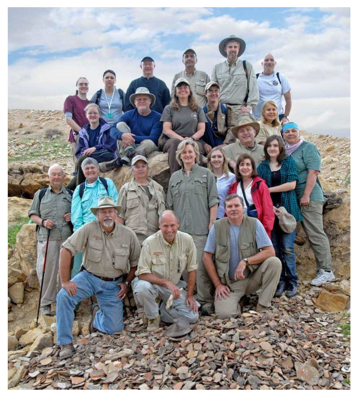
SOME OLD, SOME NEW