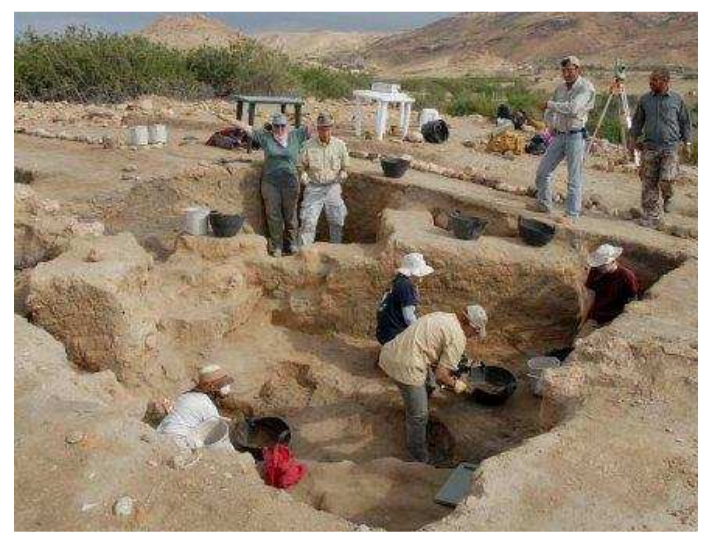
LUNCH AT ABU MUSA'S