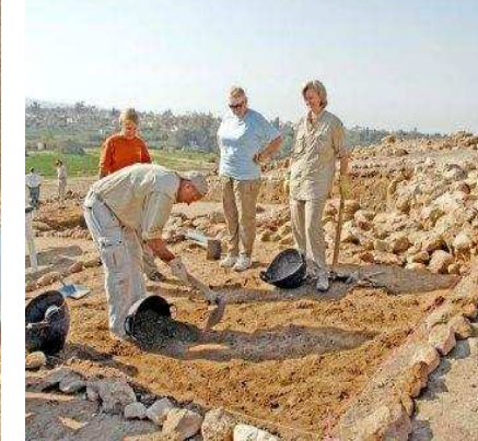
MBA POTTERY FROM TOMB CLEAN-UP