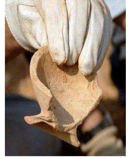
SALVAGE OPERATION AT TOMB 55