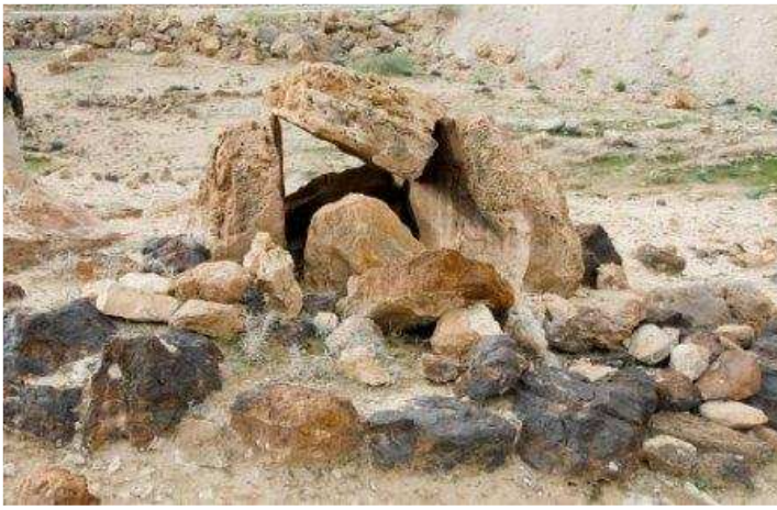
ONE OF HUNDREDS OF DOLMENS NEAR HAMMAM