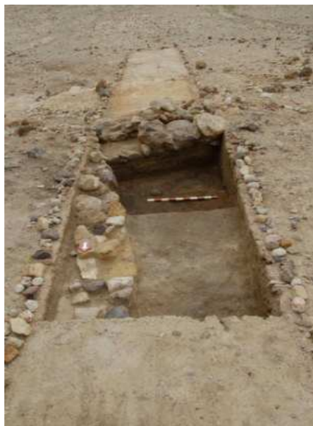
NEW TRENCH IN LOWER HAMMAM

There's so much going on around the site that it's hard to wrap your mind around it all, but we're trying our best.