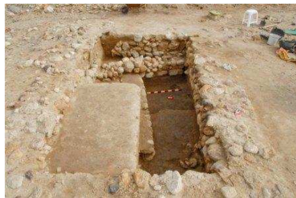
PROBE IN THE BANANA PLACE

There's so much going on around the site that it's hard to wrap your mind around it all, but we're trying our best.