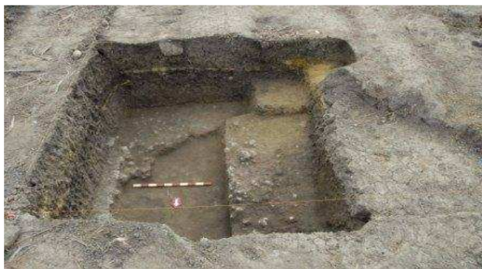
PROBE NEAR AREA R