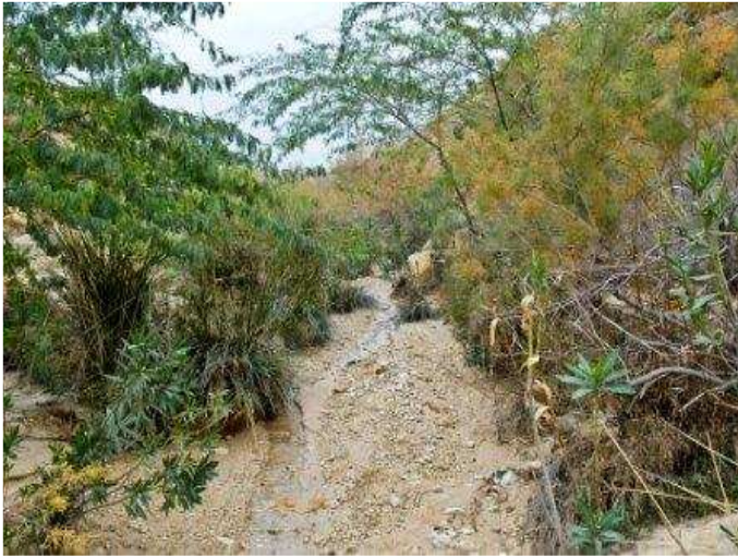
SPRING-FED OASIS IN NEARBY WADI