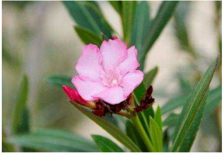
OLEANDER BLOOMING IN A NEARBY WADI